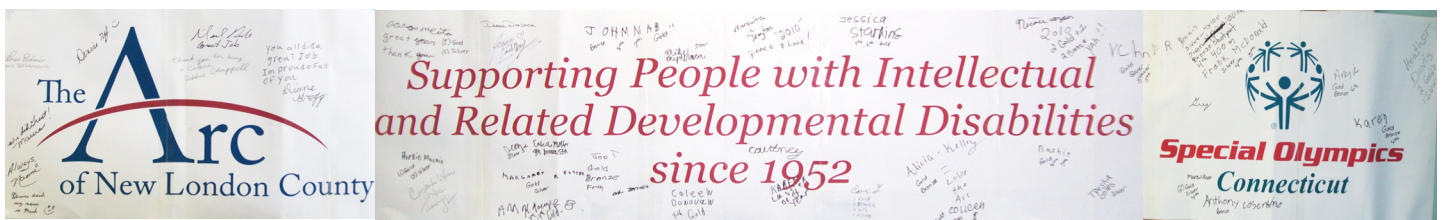
Arc banner filled with autographed statements of medal winnings by the Olympians and congratulations from staff and friends!

Congratulations Arc Special Olympians! We are proud of you!